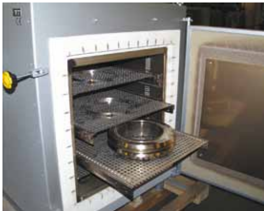
Air circulation furnace with charging grill shelves. The shelves can be moved individually on telescoping guides and can be taken out individually.