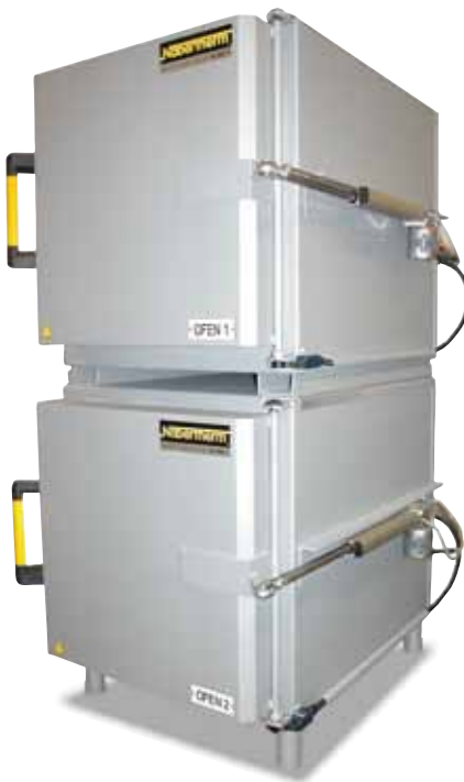
Chamber furnace system consisting of two air circulation furnaces N 250/65 HA with pneumatic swing door opening for cooling and convenient furnace charging

By upgrading a furnace with useful accessories and devices for charging, you can considerably accelerate and simplify your heat processing which increases your productivity. The solutions shown on the following pages are only a part of our program, available in this product range. Ask us about accessories you may need. Our team of skilled engineers is prepared to develop a custom solution with you for any particular problem.