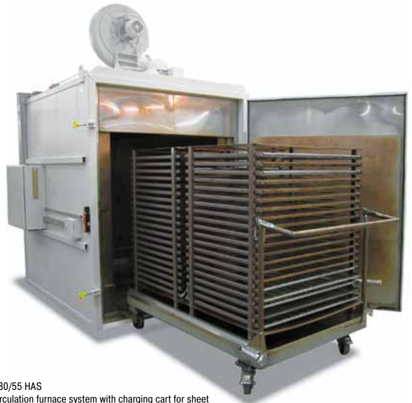
N 2380/55 HAS Air circulation furnace system with charging cart for sheet metal tempering