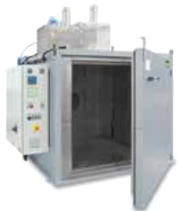
Chamber dryer KTR 2000 for binder curing after 3D-printing