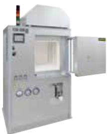
HT 160/17 DB200 for debinding and sintering of ceramics after 3D-printing

Also, concomitant or upstream processes of additive manufacturing require the use of a furnace in order to achieve the desired product properties, such as heat treatment or drying the powder.