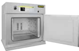
Oven TR 240 for drying of powders

In most cases, these objects must be heat treated after printing. Nabertherm offers solutions from binder curing for conservation of the green strength up to vacuum furnaces in which the objects of metal are annealed or sintered.