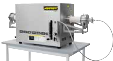
Compact tube furnace for sintering or annealing under protective gases or in a vacuum after 3D-printing