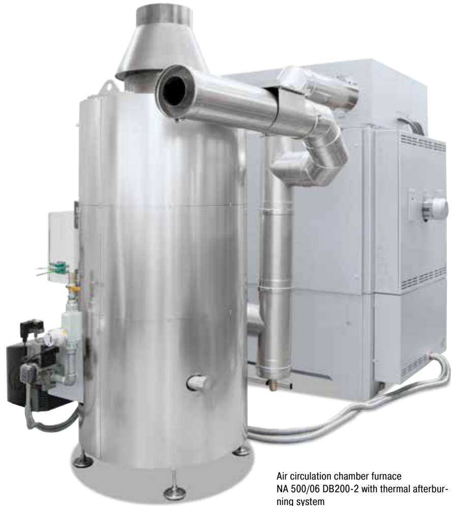
Air circulation chamber furnace NA 500/06 DB200-2 with thermal afterburning system