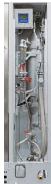
Scrubber to clean generated process gases by washing out

A scrubber will be often used if the generated gases cannot be effectively treated with a thermal afterburner system or with a torch. To clean, detox or decontaminate the exhaust gas stream a liquid is used to wash or neutralize unwanted pollutants. The scrubber can be adapted to the process by designing its liquid distribution and contact area and by selecting the most suitable washing liquid. Liquids may simply be water or special reagents or even suspensions to successfully remove unwanted gases, liquids or particles from the exhaust gas.