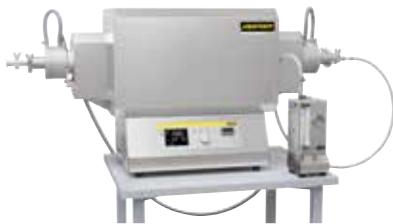
Compact tube furnace for sintering or annealing under protective gases or in a vacuum after 3D-printing