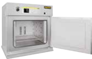
Oven TR 240 for drying of powders