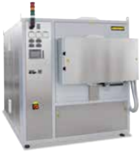
Retort furnace NR 150/11 for annealing of metal parts of 3D-printing