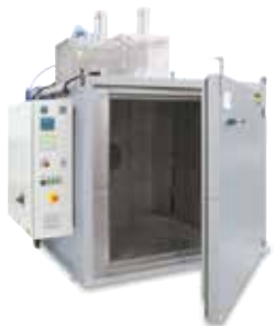
Chamber oven KTR 2000 for curing after 3D-printing