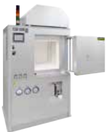
HT 160/17 DB200 for debinding and sintering of ceramics after 3D-printing

Additive manufacturing allows for the direct conversion of design construction files fully functional objects. With 3D-printing objects from metals, plastics, ceramics, glass, sand or other materials are built-up in layers until they have reached their final shape.