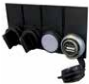
NTLog Comfort for data recording of a Siemens PLC

For protection against data manipulation the generated data records contain checksums.