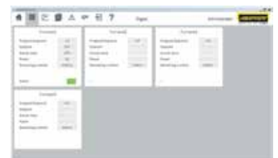
Graphic display of main overview (version with 4 furnaces)