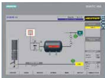
H3700 with colored graphic presentation

Nabertherm has many years of experience in the design and construction of both standard and custom control alternatives. All controls are remarkable for their ease of use and even in the basic version have a wide variety of functions.