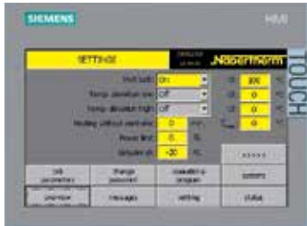
H1700 with colored, tabular depiction