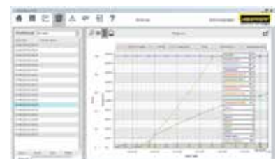
Graphic display of process curve