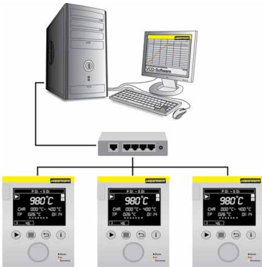
Example lay-out with 3 furnaces